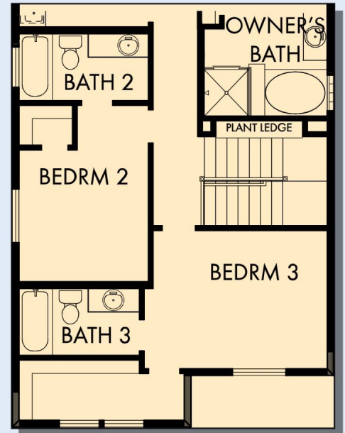
OPTIONAL EXTENDED BEDROOM 2 AND 3

For additional options, please visit DavidWeekleyHomes.com