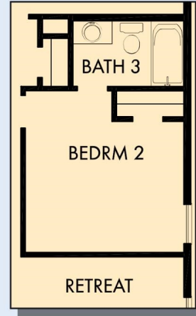
OPTIONAL BATH 3 AT BEDROOM 2