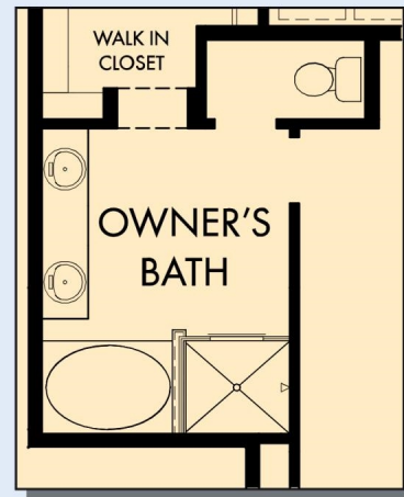
OPTIONAL SLIDE IN TUB WITH SEPARATE SHOWER AT OWNER'S BATH

For additional options, please visit DavidWeekleyHomes.com