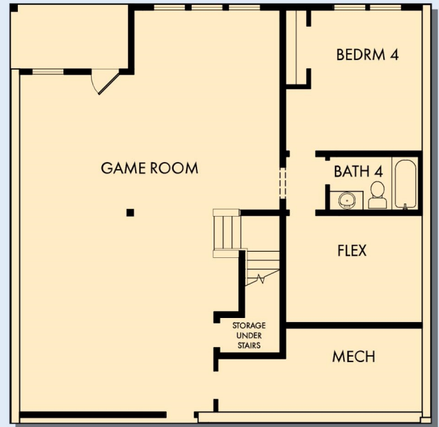
OPTIONAL GAMEROOM WITH BEDROOM 4 AND BATH 4 AT OPTIONAL BASEMENT

For additional options, please visit DavidWeekleyHomes.com