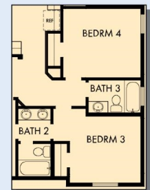
OPTIONAL BATH 3 AT BEDROOM 4