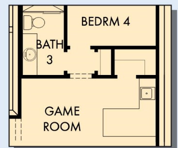
OPTIONAL WET BAR AT GAME ROOM

For additional options, please visit DavidWeekleyHomes.com