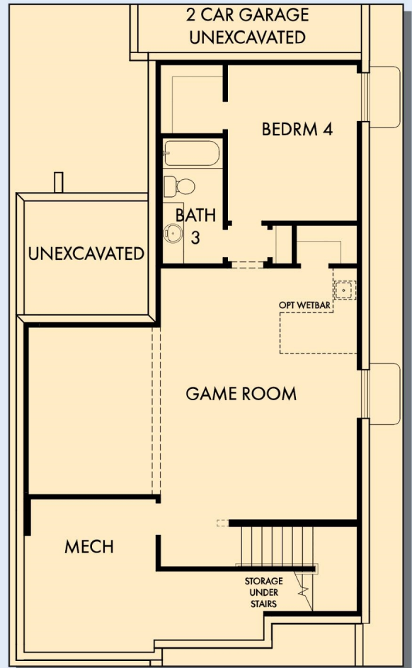
OPTIONAL GAME ROOM WITH BEDROOM 4 AND BATH 3 AT BASEMENT