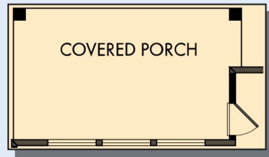
OPTIONAL EXTENDED COVERED PORCH

2,484 - 2,518 sq. ft. • 4 Bedrooms • 2 Full Baths • 1 Half Bath • 2 Car Garage