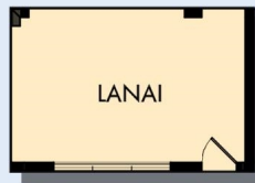
OPTIONAL EXTENDED LANAI

2,411 - 2,412 sq. ft. • 4 Bedrooms • 3 Full Baths • 2 Car Garage