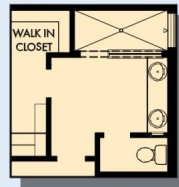
OPTIONAL SUPER SHOWER