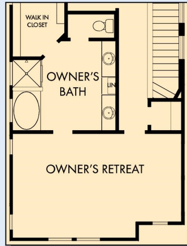
OPTIONAL SUPER OWNER'S RETREAT