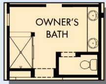
OPTIONAL SHOWER AT OWNER'S BATH

2,477 - 2,506 sq. ft. • 4 Bedrooms • 3 Full Baths • 2 - 3 Car Garage