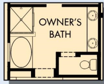
OPTIONAL TUB AND SHOWER AT OWNER'S BATH