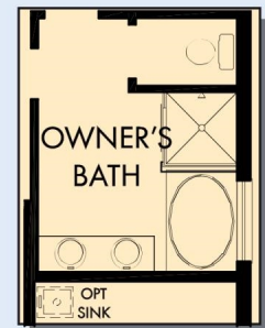
OPTIONAL TUB AND SHOWER AT OWNER'S BATH