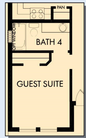
OPTIONAL GUEST SUITE WITH BATH 4 AT STUDY