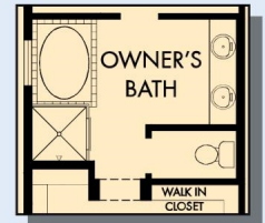
OPTIONAL DROP-IN TUB WITH SEPARATE SHOWER AT OWNER'S BATH