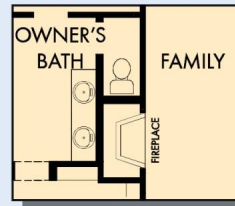
OPTIONAL WALL FIREPLACE AT FAMILY