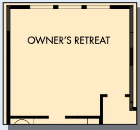
OPTIONAL EXTENDED OWNER'S RETREAT

2,481 - 2,574 sq. ft. • 4 Bedrooms • 3 Full Baths • 2 - 3 Car Garage