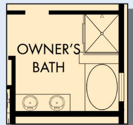
OPTIONAL SLIP-IN TUB WITH SEPARATE SHOWER AT OWNER'S BATH