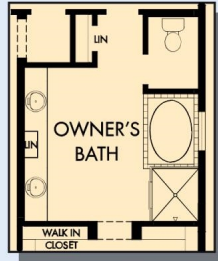
OPTIONAL DROP IN TUB WITH SEPARATE SHOWER AT OWNER'S BATH