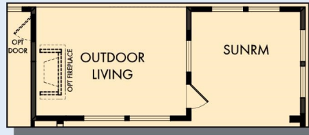
OPTIONAL OUTDOOR LIVING WITH EXTENDED SUNROOM

2,785 - 2,803 sq. ft. • 4 - 5 Bedrooms • 3 Full Baths • 1 Half Bath • 3 Car Garage