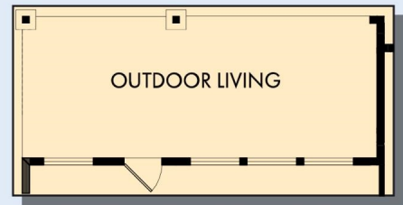
OPTIONAL OUTDOOR LIVING AT FAMILY AND DINING