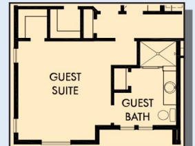
OPTIONAL GUEST SUITE AT BEDROOM 3