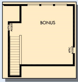
OPTIONAL SECOND FLOOR BONUS

For additional options, please visit DavidWeekleyHomes.com