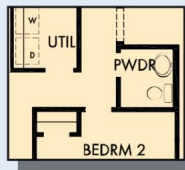
OPTIONAL POWDER BATH AT BATH 2