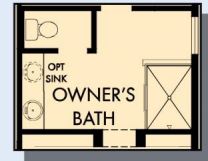
OPTIONAL SHOWER AT OWNER'S BATH