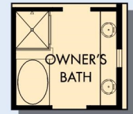
OPTIONAL SLIP-IN TUB WITH SEPARATE SHOWER AT OWNER'S BATH