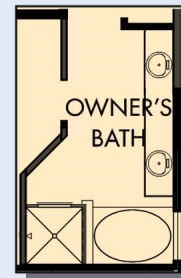
OPTIONAL SLIP-IN TUB WITH SEPARATE SHOWER AT OWNER'S BATH