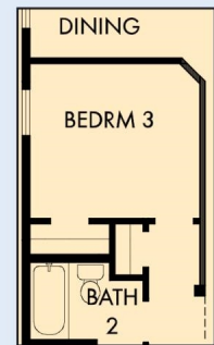
OPTIONAL BEDROOM 3 AT STUDY