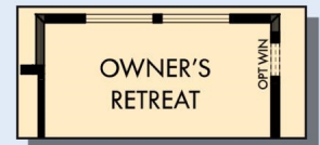
OPTIONAL EXTENDED OWNER'S RETREAT