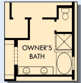
OPTIONAL SHOWER AND TUB AT OWNER'S BATH