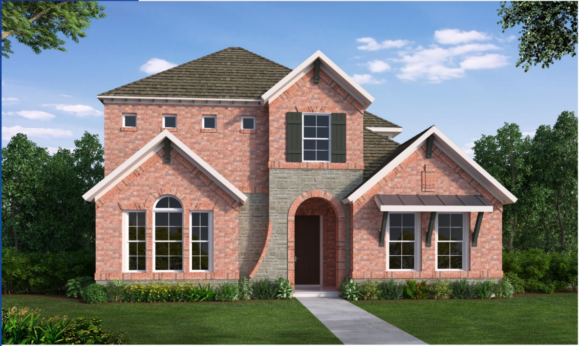
6613 DAL - A