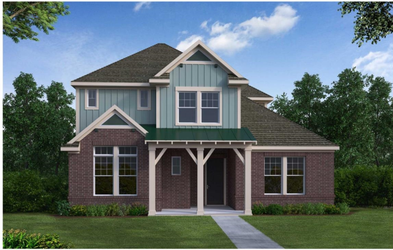
6613 DAL - B