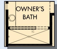
OPTIONAL SUPER SHOWER AT OWNER'S RETREAT