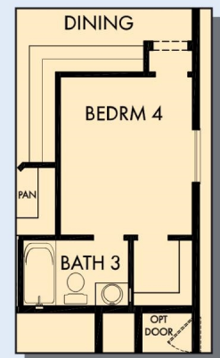
OPTIONAL CABINETS AT DINING