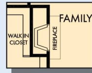
OPTIONAL WALL FIREPLACE AT FAMILY