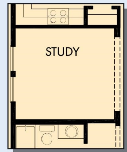
OPTIONAL STUDY AT BEDROOM 2