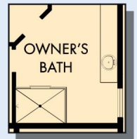
OPTIONAL SHOWER AT OWNER'S BATH