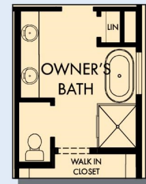
OPTIONAL FREE-STANDING TUB WITH SEPARATE SHOWER AT OWNER'S BATH