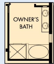
OPTIONAL SEPARATE TUB AND SHOWER AT OWNER'S BATH