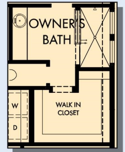
OPTIONAL WALK IN SHOWER AT OWNER'S BATH