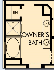
OPTIONAL SLIP IN TUB WITH SEPARATE SHOWER AT OWNER'S BATH