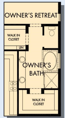
OPTIONAL SUPER OWNER'S BATH