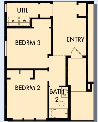
OPTIONAL BEDROOM 3 AT STUDY