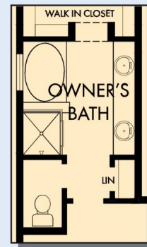
OPTIONAL SLIDE IN TUB WITH SEPARATE SHOWER AT OWNER'S BATH