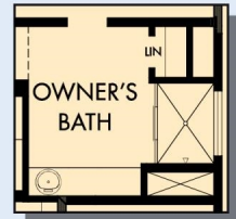
OPTIONAL SHOWER AT OWNER'S BATH