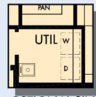
OPTIONAL SINK AT UTILITY