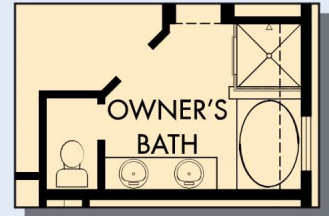
OPTIONAL SLIDE IN TUB WITH SEPARATE SHOWER AT OWNER'S BATH