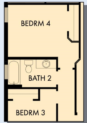
OPTIONAL BEDROOM 4 AT STUDY