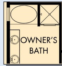
OPTIONAL SHOWER AND TUB AT OWNER'S BATH