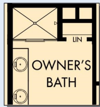
OPTIONAL SHOWER AT OWNER'S BATH