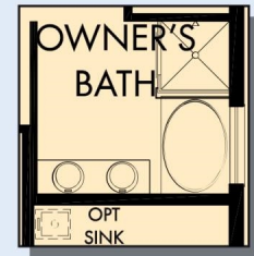
OPTIONAL TUB AND SHOWER AT OWNER'S BATH