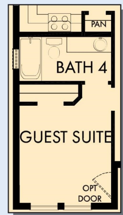
OPTIONAL GUEST SUITE AT STUDY