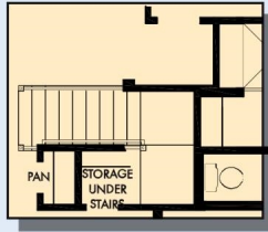
FIRST FLOOR WITH OPTIONAL SECOND FLOOR BONUS

2,295 - 2,348 sq. ft. • 3 Bedrooms • 2 Full Baths • 1 - 2 Half Baths • 2 Car Garage