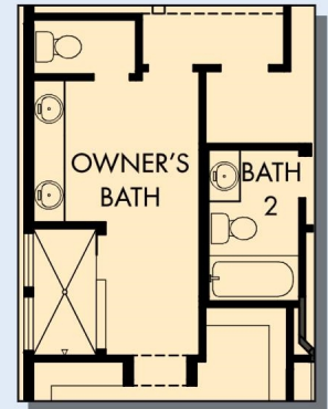
OPTIONAL SUPER SHOWER AT OWNER'S BATH