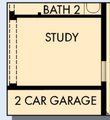
OPTIONAL STUDY AT BEDROOM 3