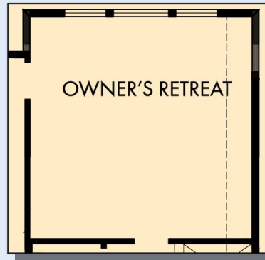
OPTIONAL EXTENDED OWNER'S RETREAT