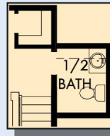
OPTIONAL HALFBATH AT OPTIONAL BONUS