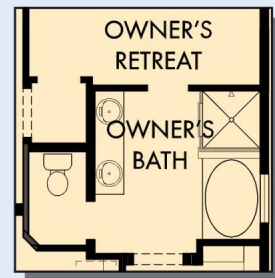
OPTIONAL SLIDE-IN TUB WITH SEPARATE SHOWER AT OWNER'S BATH