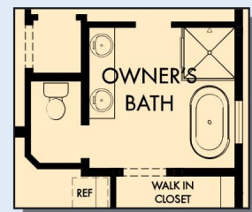
OPTIONAL FREE STANDING TUB WITH SEPARATE SHOWER AT OWNER'S BATH