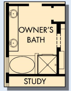
OPTIONAL SLIP IN TUB WITH SEPARATE SHOWER AT OWNER'S BATH