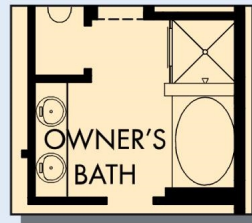
OPTIONAL SHOWER AND TUB AT OWNER'S BATH