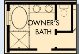
OPTIONAL DROP IN TUB AND SEPARATE SHOWER AT OWNER'S BATH