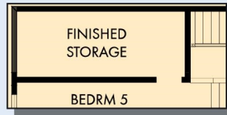
OPTIONAL FINISHED STORAGE