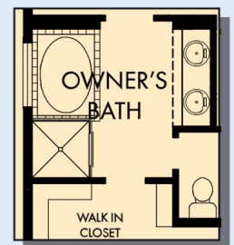
OPTIONAL DROP IN TUB AND SEPARATE SHOWER AT OWNER'S BATH