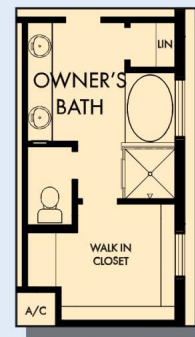
OPTIONAL TUB AND SHOWER AT OWNER'S BATH